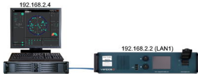
Quantum and LD6 on the same subnet

The Windows PC must be on the same network as the LD6. To find and change the LD6 network settings, from the home screen, navigate to Settings > Network > Status and use the Up/Down arrows to show the IP address for each LAN.