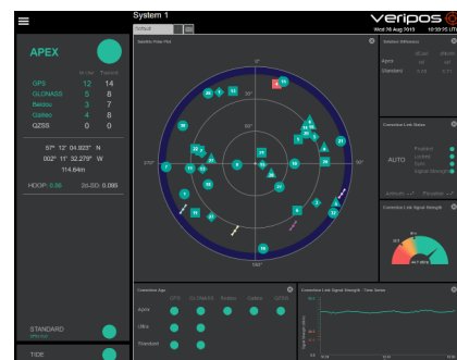
Quantum display post-configuration

For further guidance, refer to the Quantum User Manual , or raise a request for technical support via the VERIPOS Support Portal or an email to support.veripos@hexagon.com .