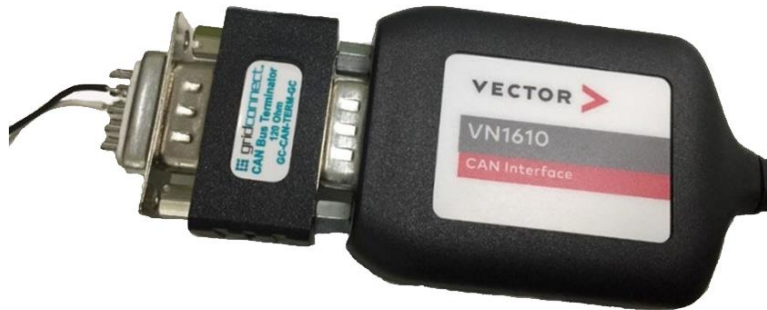
Figure 3: Sample setup

In the below picture, you can see a sample set-up. This includes a 120 Ohm terminator, the wiring coming from the two CAN lines on the PwrPak7 (CAN+, CAN-), and a Vector CAN interface convertor which takes the CAN output and converts it to USB to communicate with a PC. There are various third-party software programs available which can then decode and analyze the CAN output.