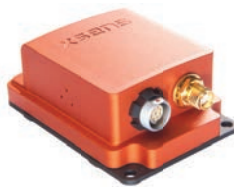
MTi-G-710 encased: 57x42x23.5 mm, 55g, 9-pins push-pull connector