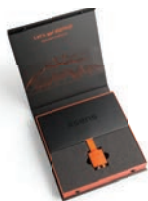
MTi-G-710 Development Kit: MTi-G-710, antenna, software and cabling