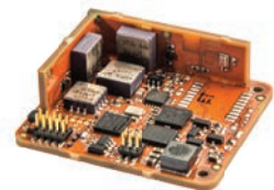
MTi-G-710 OEM: 37x33x12 mm, 11g, 16-pins header