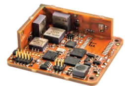
MTi OEM: 37x33x12 mm, 11g, 16-pins header