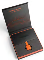
MTi 10-series Development Kit: MTi, software and cabling