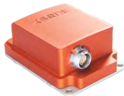
MTi encased: 57x42x23.5 mm, 52g, 9-pins push-pull connector